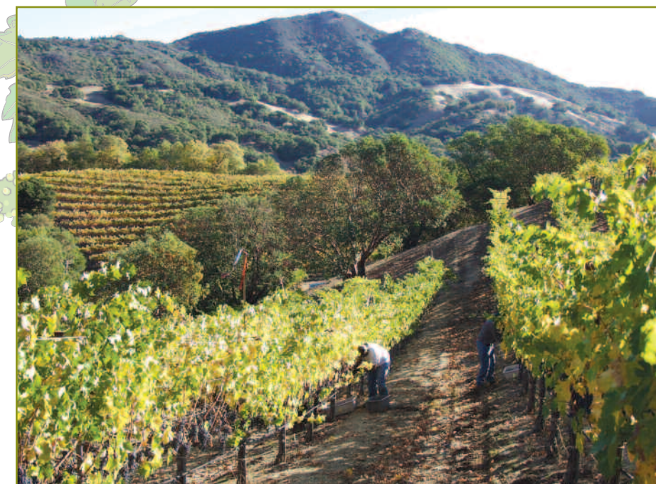
Mt. Veeder is a large appellation - over 25 square miles - but less than 10% percent is planted to vineyards due to the steep, remote terrain. Our Mt. Veeder Cabernet comes from a premier vineyard along the summit at 1800 feet which produces powerful, rich and complex wines.